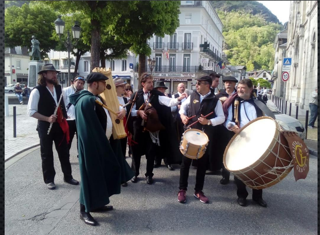
Bagnères de Luchon (France)