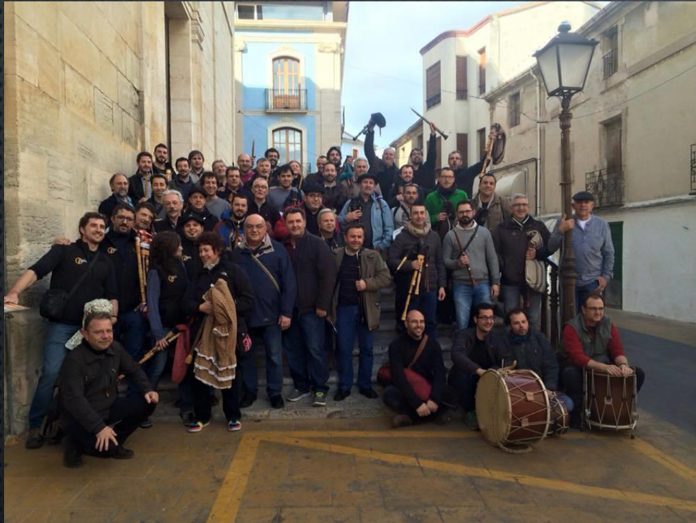
Muro d'Alcoi (València)